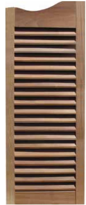
Shown With Café Curve Top