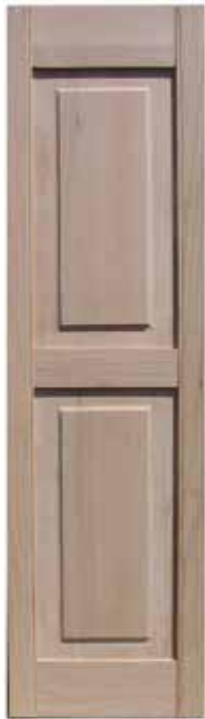
STAIN GRADE RED OAK