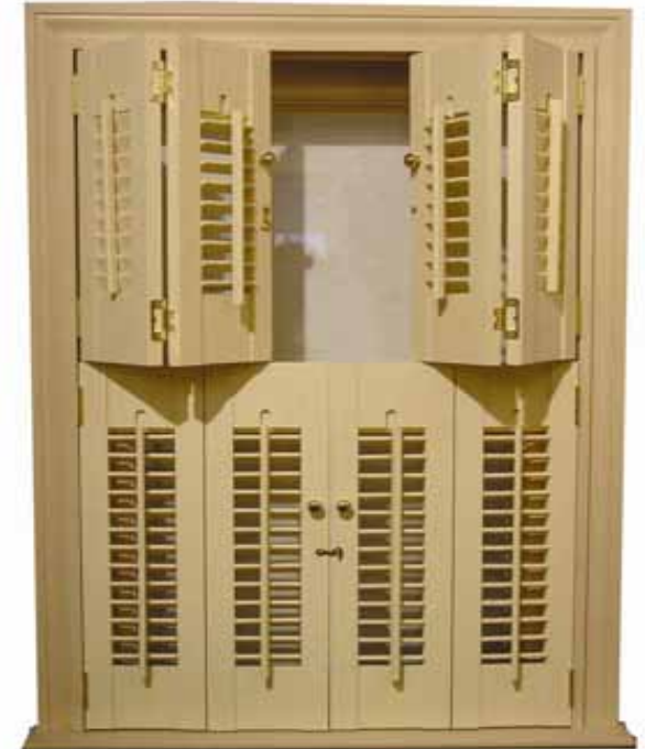
Solid hardwood paint grade shutters!

Prices are unfinished - Priming & painting options on page 9