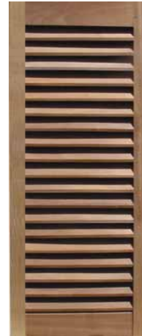
STAIN GRADE MAHOGANY - Add 35%