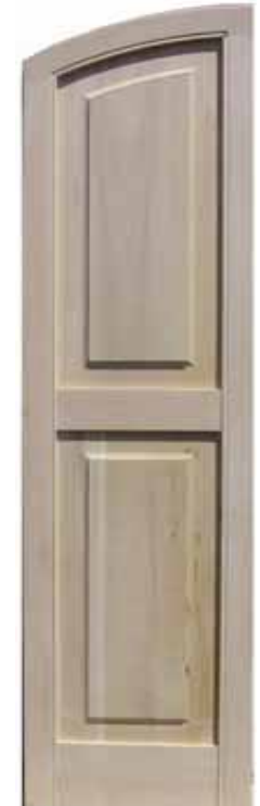
Basswood (shown with curve)