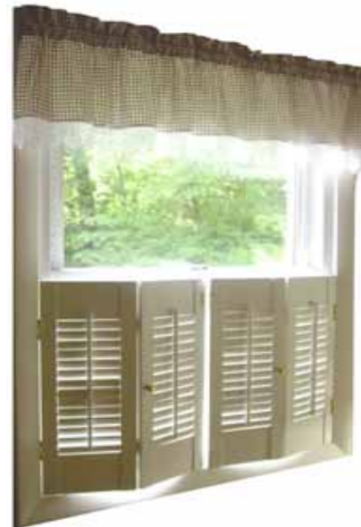
Traditional Bifolding Louvers