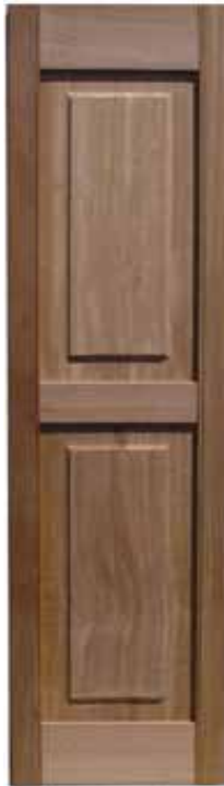
STAIN GRADE MAHOGANY