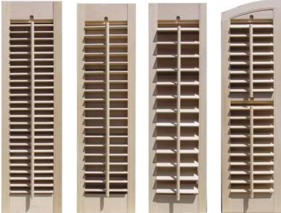
1 7/8" Louvers 2 1/2" Louvers 3 1/2" Louvers 1 7/8" Louvers All available with or without center rail (shown with curve & center rail)