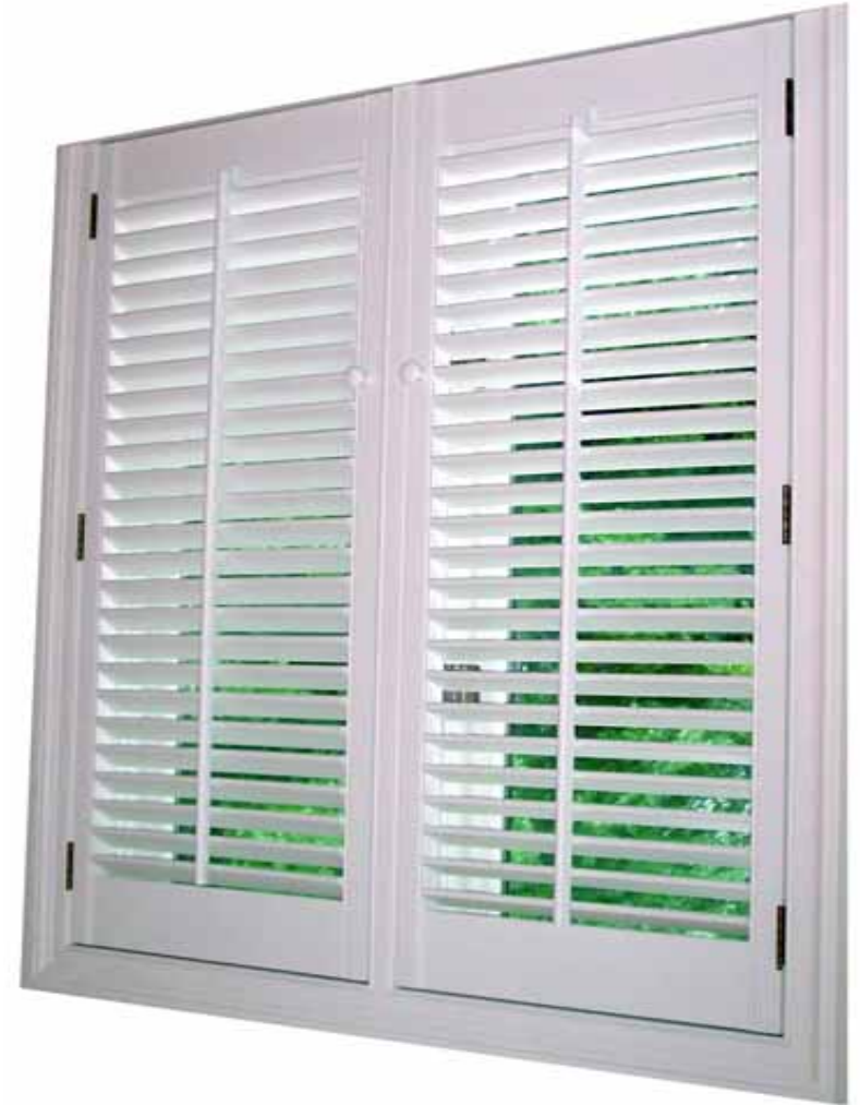
Plantation Shutters (shown with no center rail)

Tall Set - 6 butt hinges, 2 knobs, latch, screws - $18