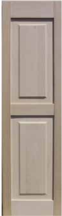
PAINT GRADE BASSWOOD