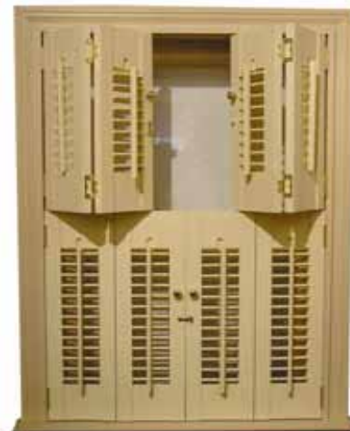
Classic louvered shutters are used in colonials, victorians, arts & crafts homes, and often bifolded.

ORDER ANY SIZE TO THE 1/16" - ROUND UP FOR PRICE PER SHUTTER