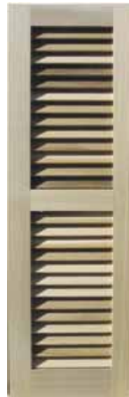
INT-DE-FL 1 7/8" Louvers

These hefty interior fixed louvers are used as doors on pantries, closets, cabinets, shelves, and more. Call for quote using mahogany or red oak.