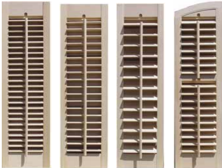
MLIP 1 7/8" Louvers MLIP 2 1/2" Louvers MLIP 3 1/2" Louvers MLIP Small Curve (shown w/cross rail)