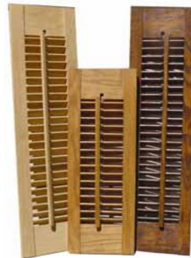
Solid Red Oak Shutters

ORDER ANY SIZE TO THE 1/16" - ROUND UP FOR PRICE PER SHUTTER