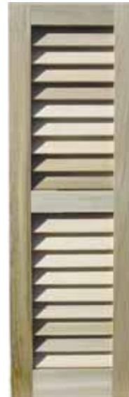
INT-DE-FL 2 1/2" Louvers