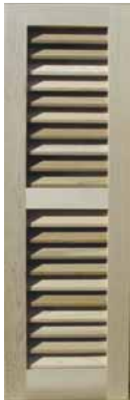
INT-DE-FLE European Flat Edge Beveled 2 1/4"